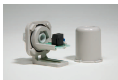
Weather compensation control sensor

Ask your engineer to install the weather compensation control sensor, supplied with the Linea One, to increase its efficiency by 3%